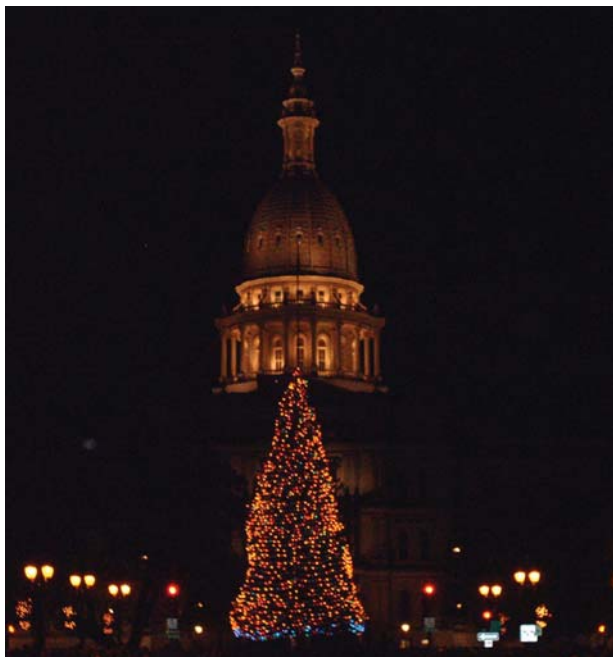
The 2007 holiday tree at the State Capitol in Lansing was harvested from Escanaba Township, Delta County. They are proud of their contribution to this year's holiday celebration.

Have you submitted your township pride photos?